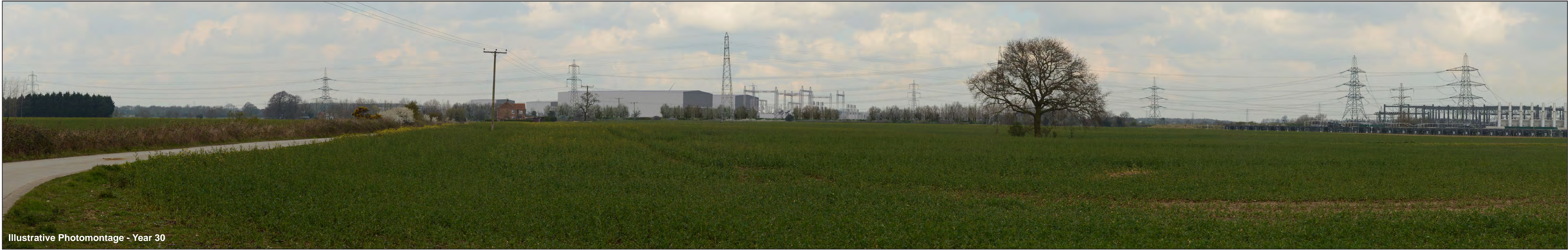
Illustrative Photomontage - Year 30