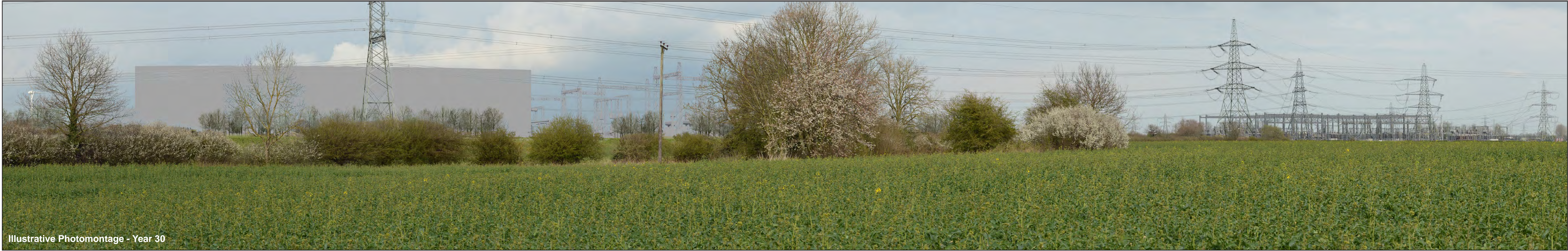
Figure: 3 Viewpoint 1: PRow South of Burn Park Farm

OS reference: 503721 E 434760 N Horizontal field of view: 90° (cylindrical projection) Camera: Nikon D600 AOD: 14.99 m Principal distance: 522 mm Lens: AF 50mm f/1.8D Direction of view: 70° Paper size: 841 x 297 mm (half A1) Camera height: 1.5 m AGL Distance to site: 0.24 km Correct printed image size: 820 x 260 mm Date and time: 03/04/2019 13:50