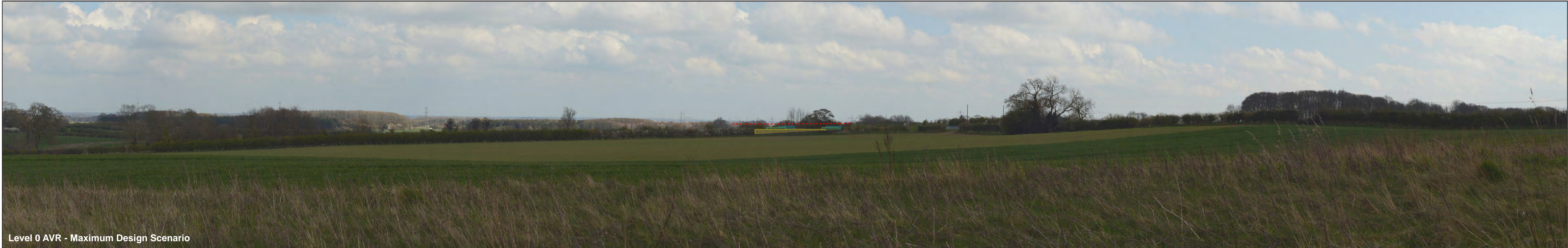
Figure: 14 Viewpoint 6: Fishpond Wood, Risby Hall

EBI and Substation Area (15m Height) EBI Buildings (20m Height) Substation Buildings (25m Height) Lightning Protection (30m Height)