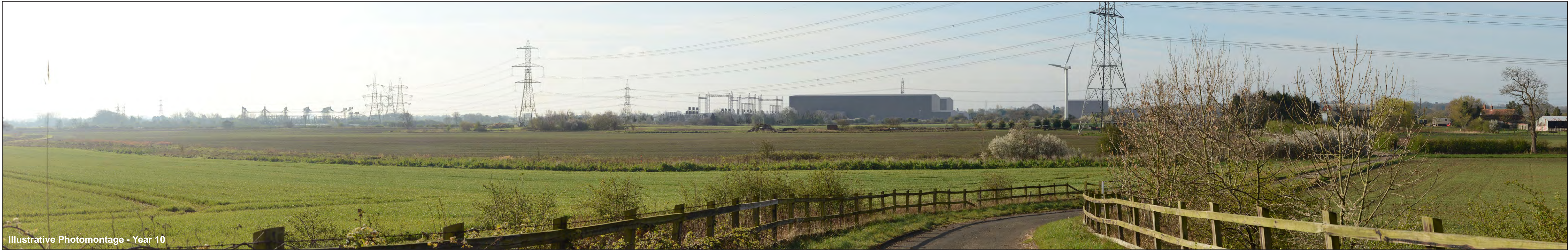
Illustrative Photomontage - Year 10