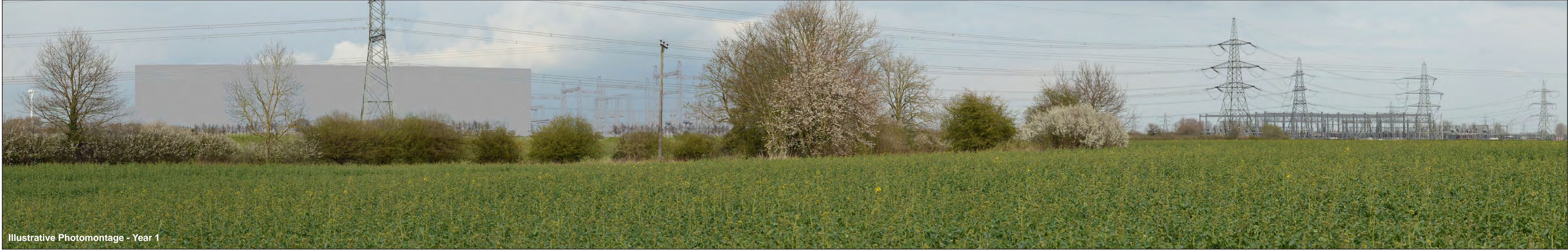
Illustrative Photomontage - Year 1