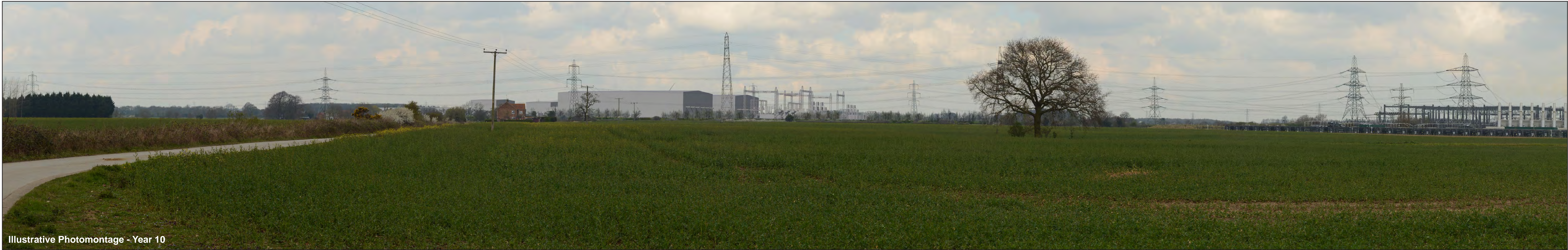
Illustrative Photomontage - Year 10