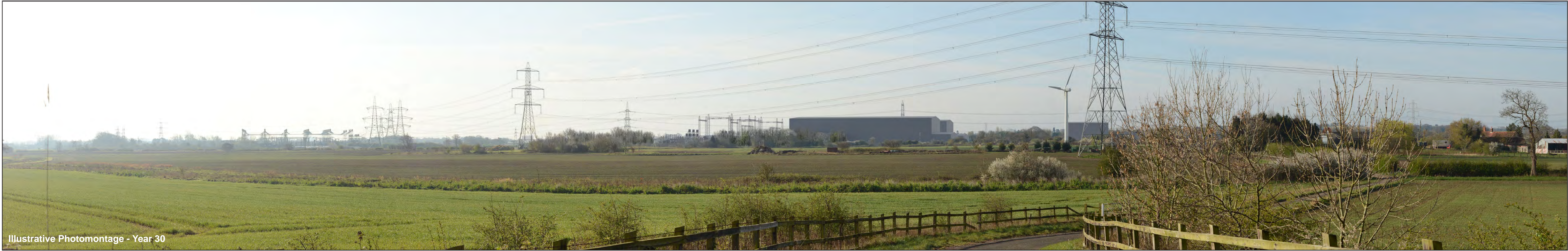
Illustrative Photomontage - Year 30