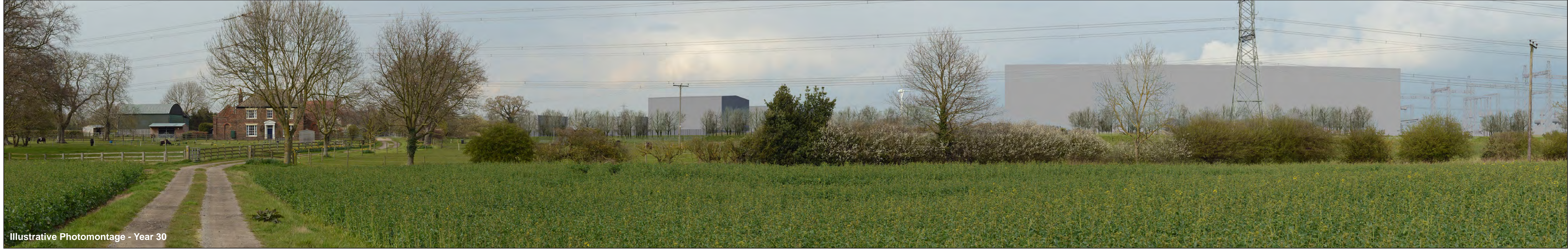
Figure 3 Viewpoint 1: PRow South of Burn Park Farm

OS reference: 503721 E 434760 N Horizontal field of view: 90° (cylindrical projection) Camera: Nikon D600 AOD: 14.99 m Principal distance: 522 mm Lens: AF 50mm f/1.8D Direction of view: 25° Paper size: 841 x 297 mm (half A1) Camera height: 1.5 m AGL Distance to site: 0.24 km Correct printed image size: 820 x 260 mm Date and time: 03/04/2019 13:50