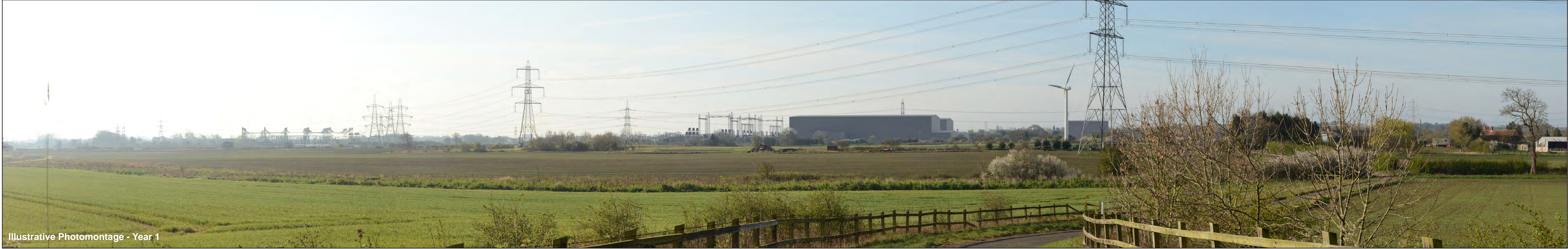
Illustrative Photomontage - Year 1