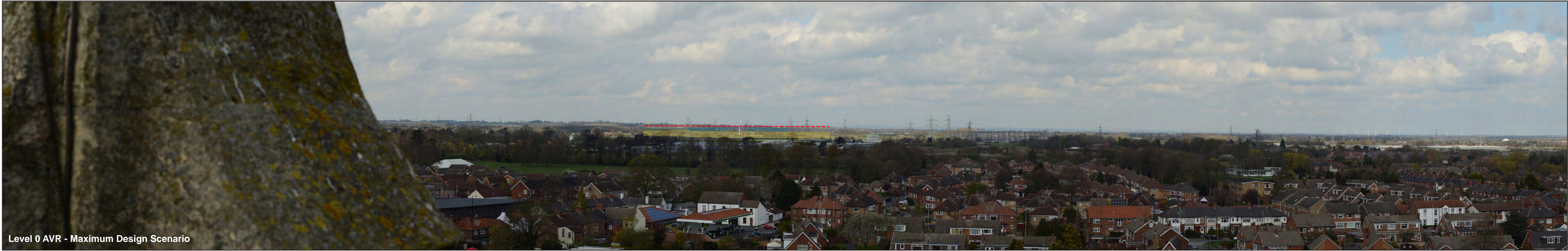
Level 0 AVR - Maximum Design Scenario

This image provides landscape and visual context only