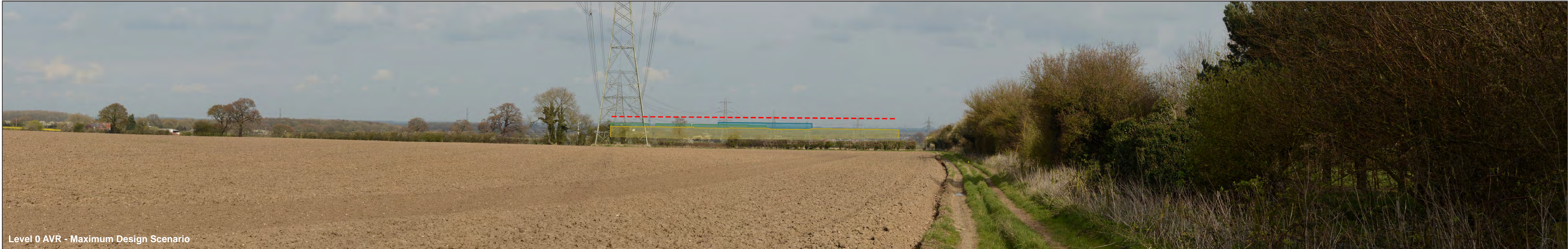
Figure: 10 Viewpoint 4: PRow East of A164

EBI and Substation Area (15m Height) EBI Buildings (20m Height) Substation Buildings (25m Height) Lightning Protection (30m Height)