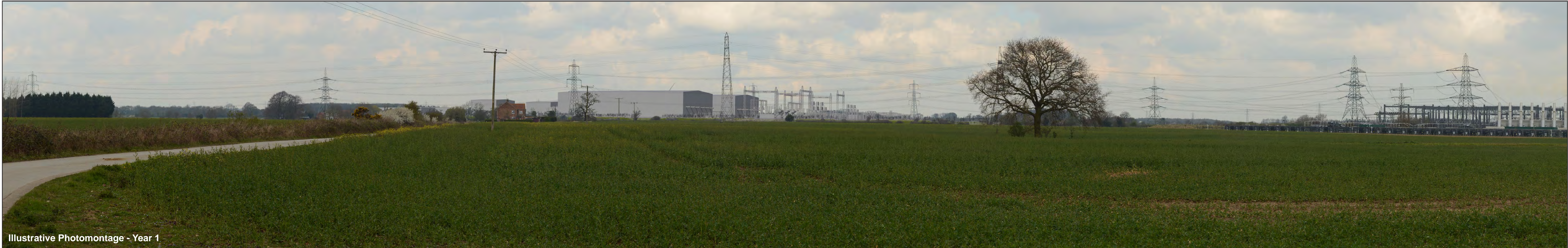
Figure: 5 Viewpoint 2: Park Lane Cottingham

OS reference: 504069 E 434252 N Horizontal field of view: 90° (cylindrical projection) Camera: Nikon D600 AOD: 14.92 m Principal distance: 522 mm Lens: AF 50mm f/1.8D Direction of view: 350° Paper size: 841 x 297 mm (half A1) Camera height: 1.5 m AGL Distance to site: 0.66 km Correct printed image size: 820 x 260 mm Date and time: 03/04/2019 12:10