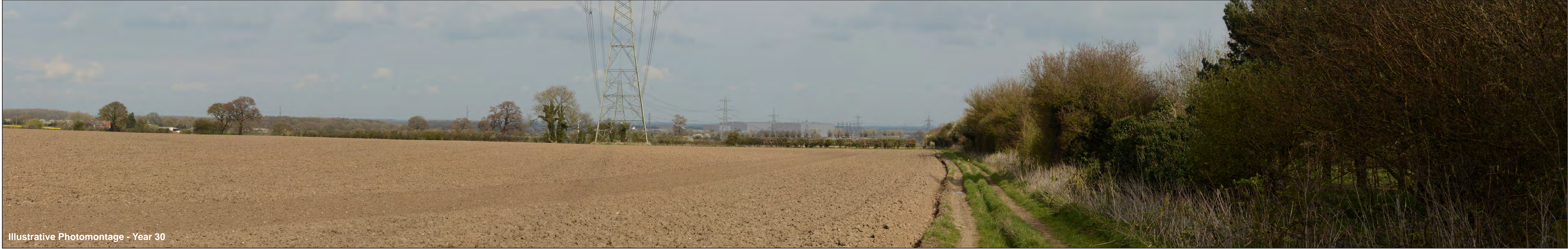
Illustrative Photomontage - Year 30