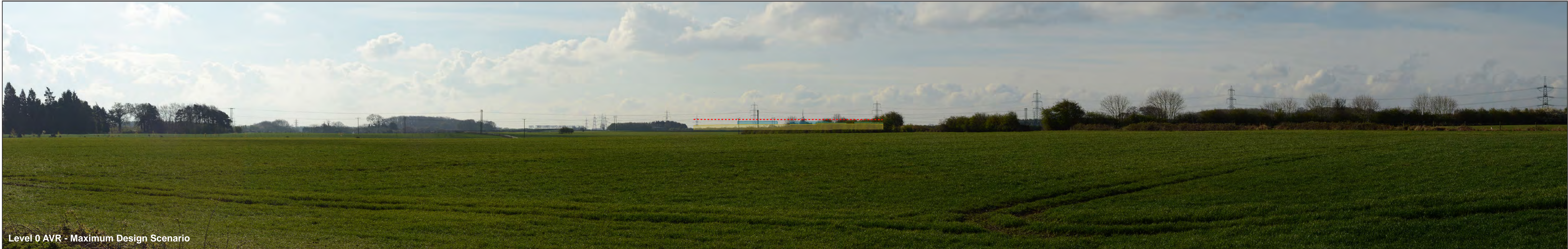
Figure: 16 Viewpoint 8: Minster Way

EBI and Substation Area (15m Height) EBI Buildings (20m Height) Substation Buildings (25m Height) Lightning Protection (30m Height)