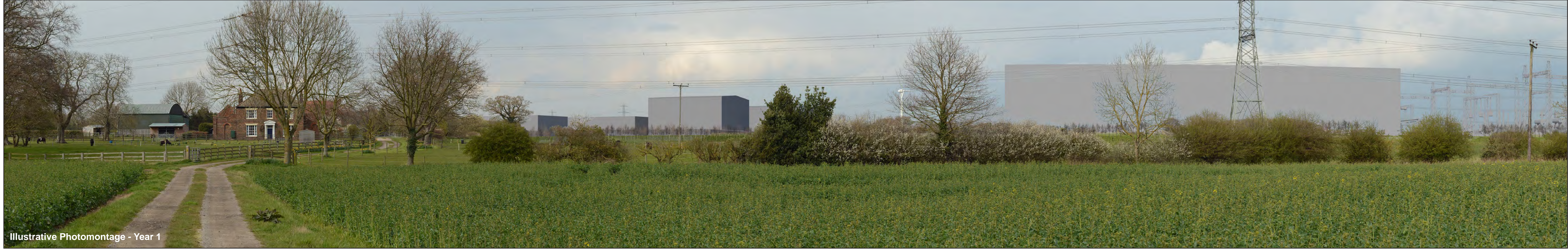
Figure: 2 Viewpoint 1: PRow South of Burn Park Farm

OS reference: 503721 E 434760 N Horizontal field of view: 90° (cylindrical projection) Camera: Nikon D600 AOD: 14.99 m Principal distance: 522 mm Lens: AF 50mm f/1.8D Direction of view: 25° Paper size: 841 x 297 mm (half A1) Camera height: 1.5 m AGL Distance to site: 0.24 km Correct printed image size: 820 x 260 mm Date and time: 03/04/2019 13:50