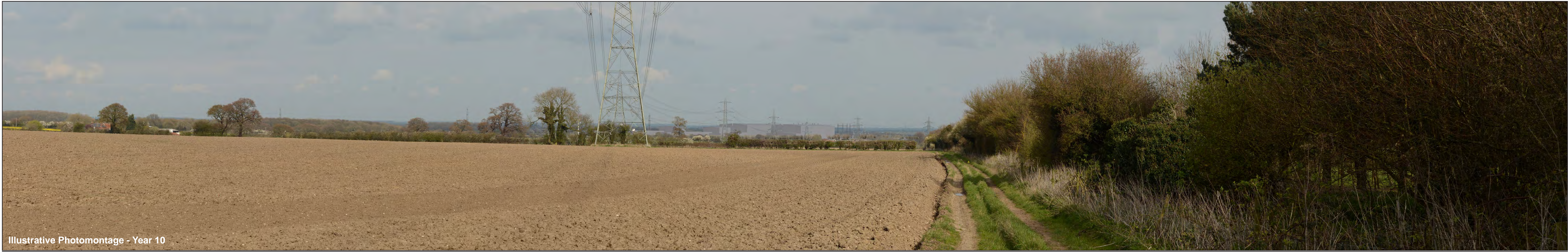
Illustrative Photomontage - Year 10