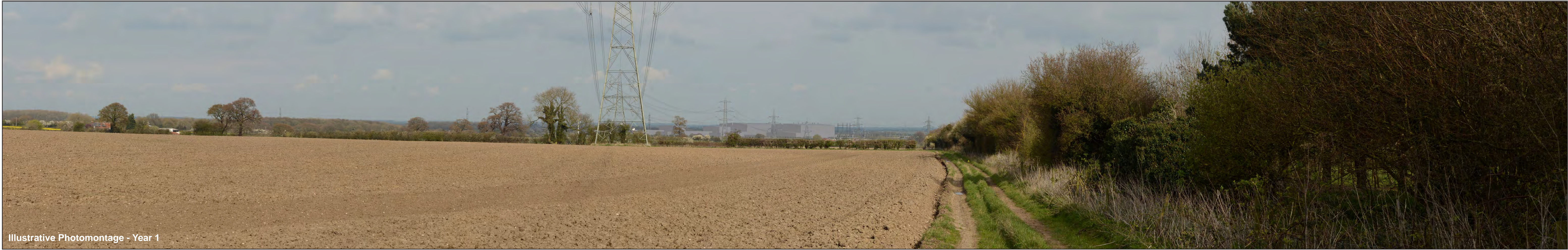
Illustrative Photomontage - Year 1

This image provides landscape and visual context only